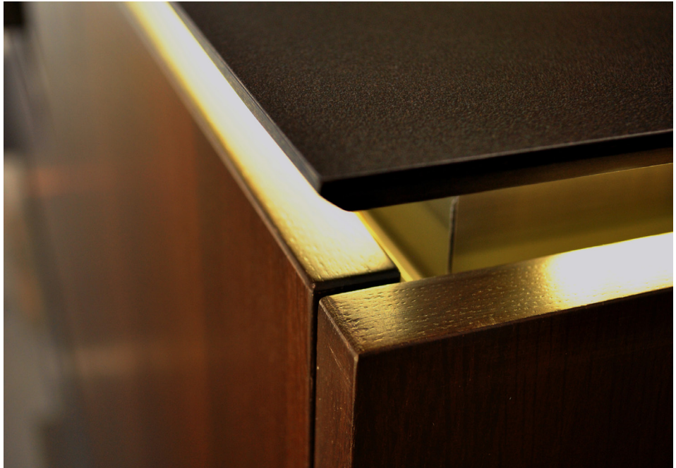
DETAIL: WROUGHT FENIX