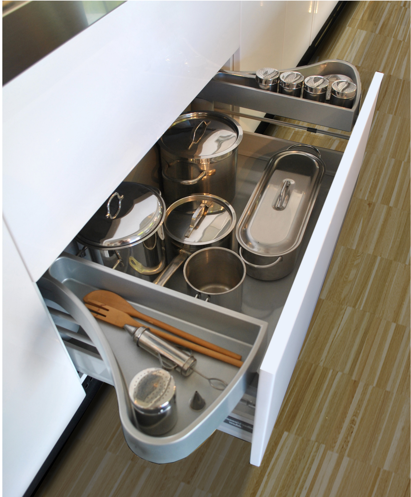
COOKING AREA WITH BIG PAN-HOLDER BASKET AND PULL-OUT ACCESSORY-HOLDER ON THE SIDE