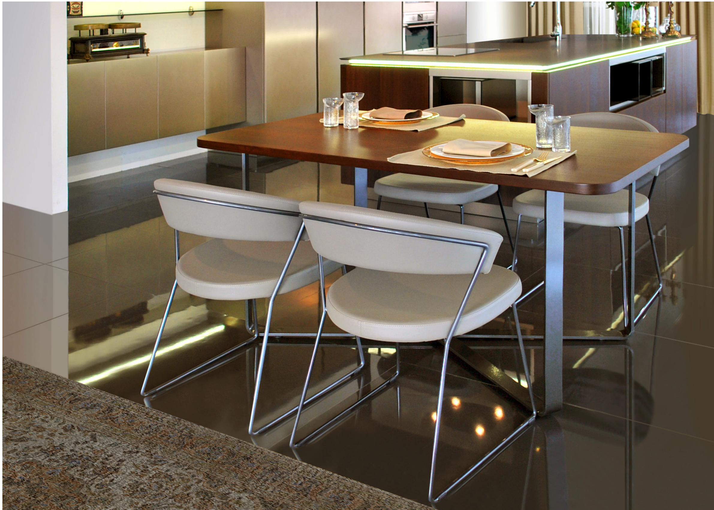
TABLE WITH METAL STRUCTURE, THERMOMECHANICALLY-PROCESSED DURMAST TOP AND DOVE-GREY ECO- LEATHER CHAIRS