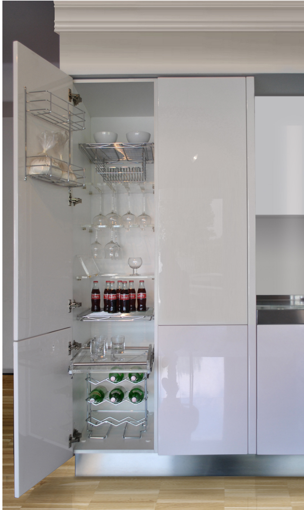
COLUMN WITH BOTTLE- RACK AND GLASS- HOLDER ACCESSORIES