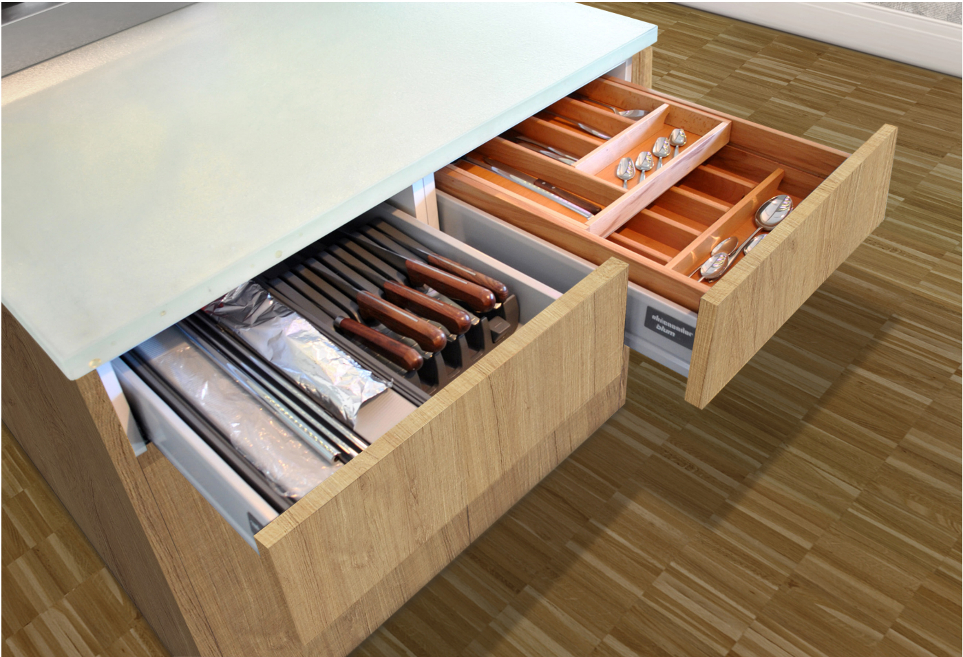
DRAWER WITH KNIFE-HOLDER AND ROLL- HOLDER AND DRAWER WITH SLIDING DOUBLE CUTLERY-HOLDER IN WOOD