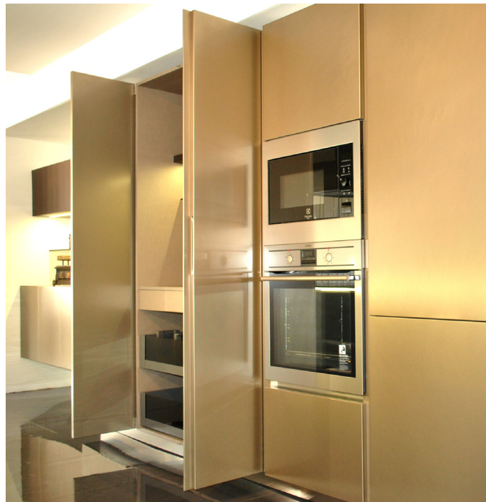
WORK COLUMN IN GARNISHED FACED PANELS AND DISAPPEARING DOORS THAT SLIDE IN THE SIDE COMPARTMENT