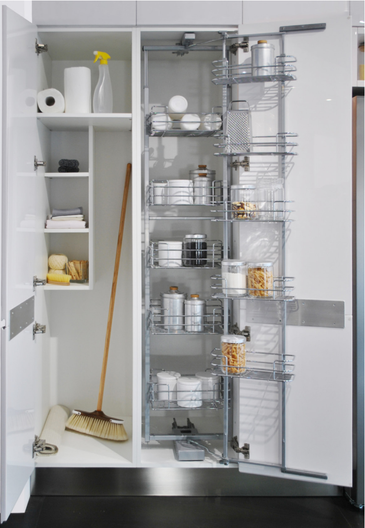
PANTRY COLUMN WITH REMOVABLE BASKETS AND BROOM COLUMN