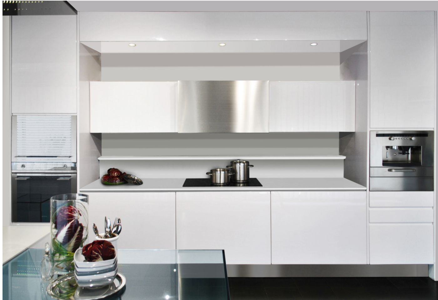
COOKING AREA WITH WALL UNITS WITH SELF-STABILIZING OPENING, ENHANCED WITH ELECTRICAL CONNECTIONS THAT ALLOW FOR HANDLE-LESS CABINET DOORS WHICH OPEN AND CLOSE WITH LIGHT TOUCHES