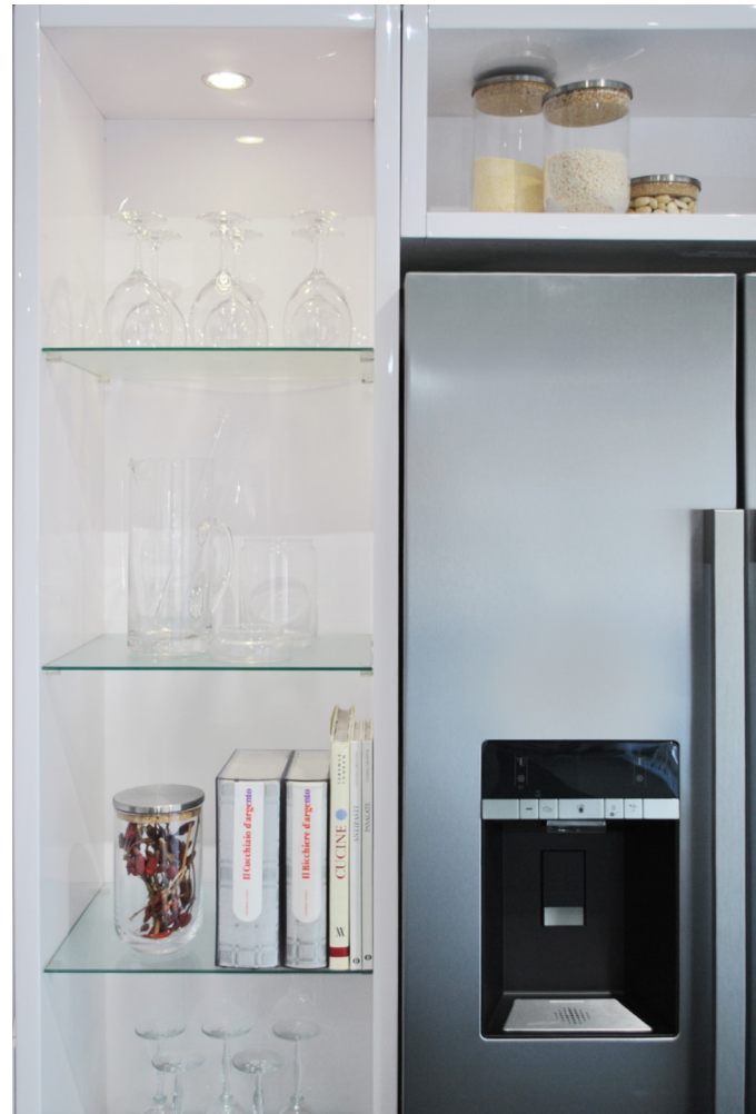
WALL WITH WORKING COLUMNS, OPEN-WORKED COMPARTMENTS AND STOREY EXTENSIONS