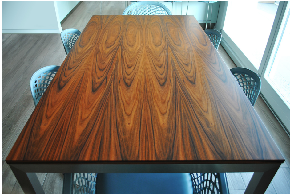
TABLE WITH ROSEWOOD TOP AND STEEL STRUCTURE, FULL-GRAINED LASER-CUT LEATHER CHAIRS