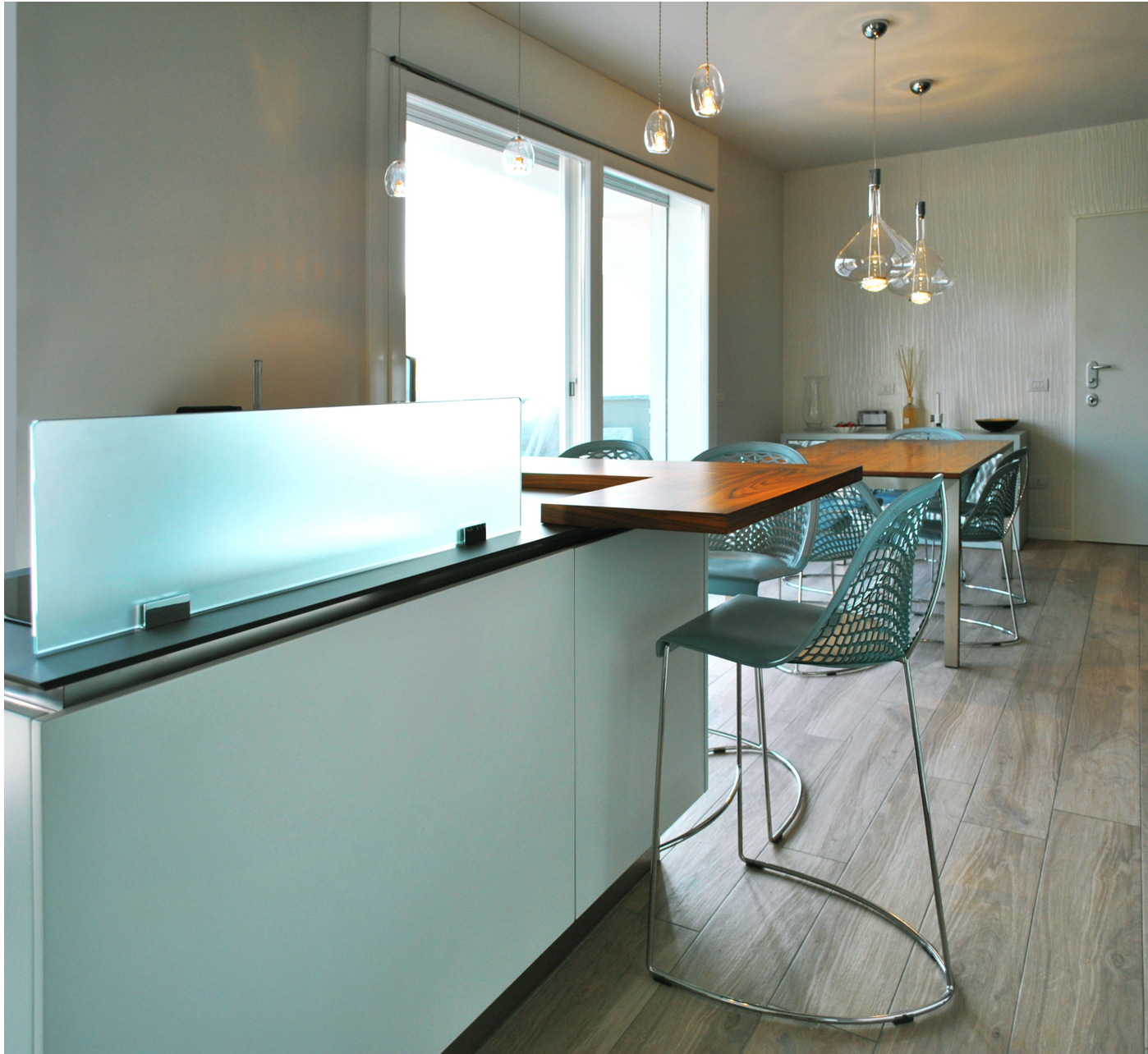
ISLAND WITH SATIN-FINISHED GLASS COOKTOP COVER. ROSEWOOD SNACK TABLE WITH COORDINATED STOOLS AND LIVING AREA