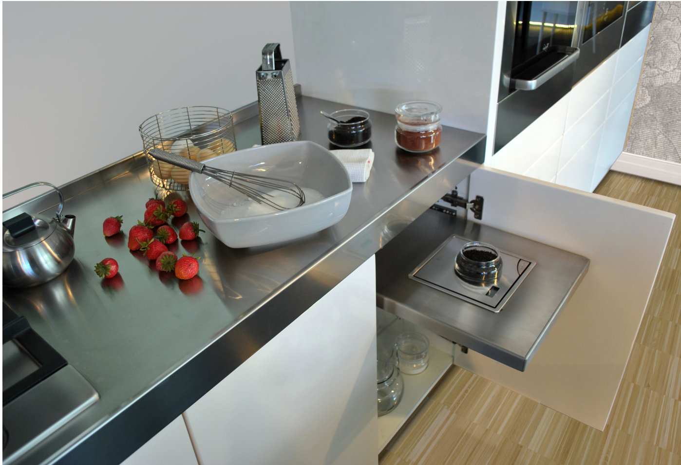
STAINLESS STEEL COUNTERTOP WITH DRIPLESS EDGE AND BASIS WITH DOOR FOR PULL-OUT SCALE