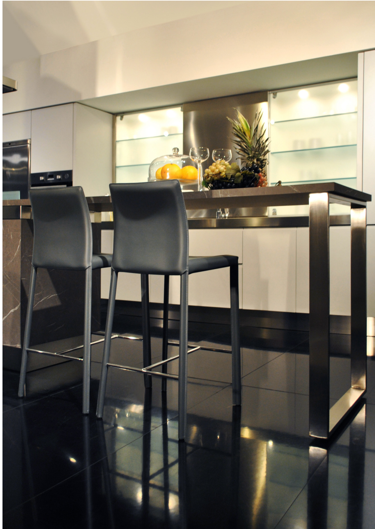
'U'-SHAPED SNACK STRUCTURE IN STEEL AND GRAY LEATHER STOOLS