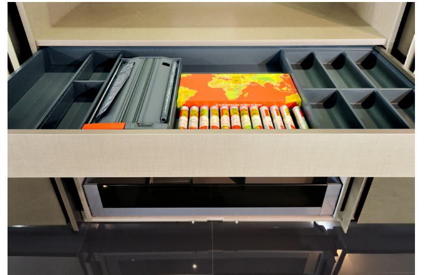
INSIDE OF THE WORKING COLUMN WITH MOVABLE MAGNETIC DIVIDERS, DISH-HOLDER AND FULLY- EQUIPPED DRAWER