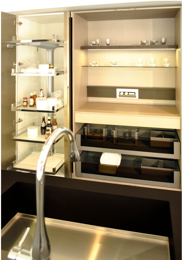
INTERNAL VIEW ON THE PANTRY COLUMN AND WORK COLUMN WITH POWER PLUGS, INTERNAL LED LIGHTING AND GLASS DRAWER FRONTS