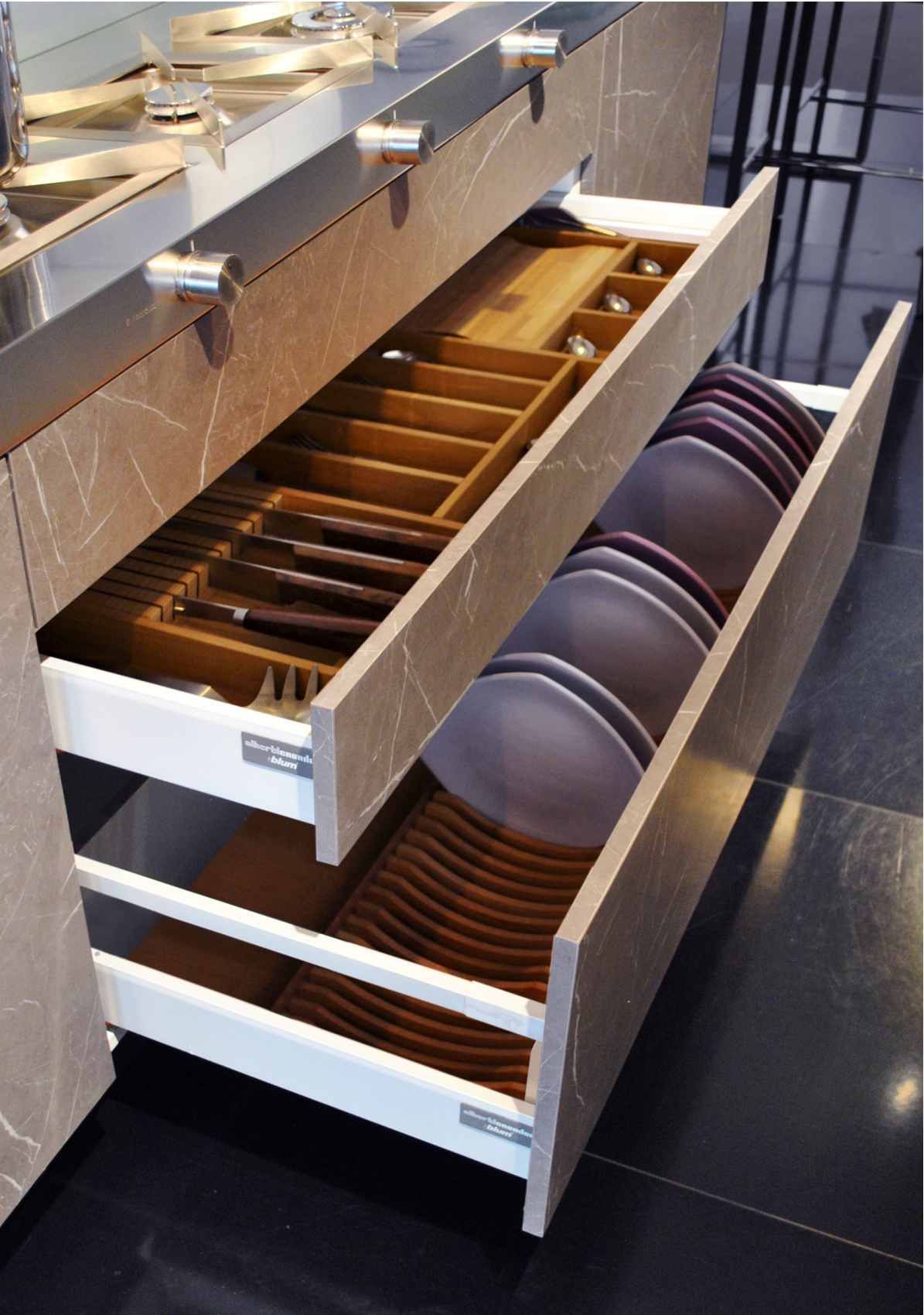
DRAWERS WITH ELECTRICAL OPENING AND SHOCK ABSORBERS; WOODEN EQUIPMENT WITH DISH- HOLDER, SILVERWARE-HOLDER AND KITCHEN ACCESSORIES