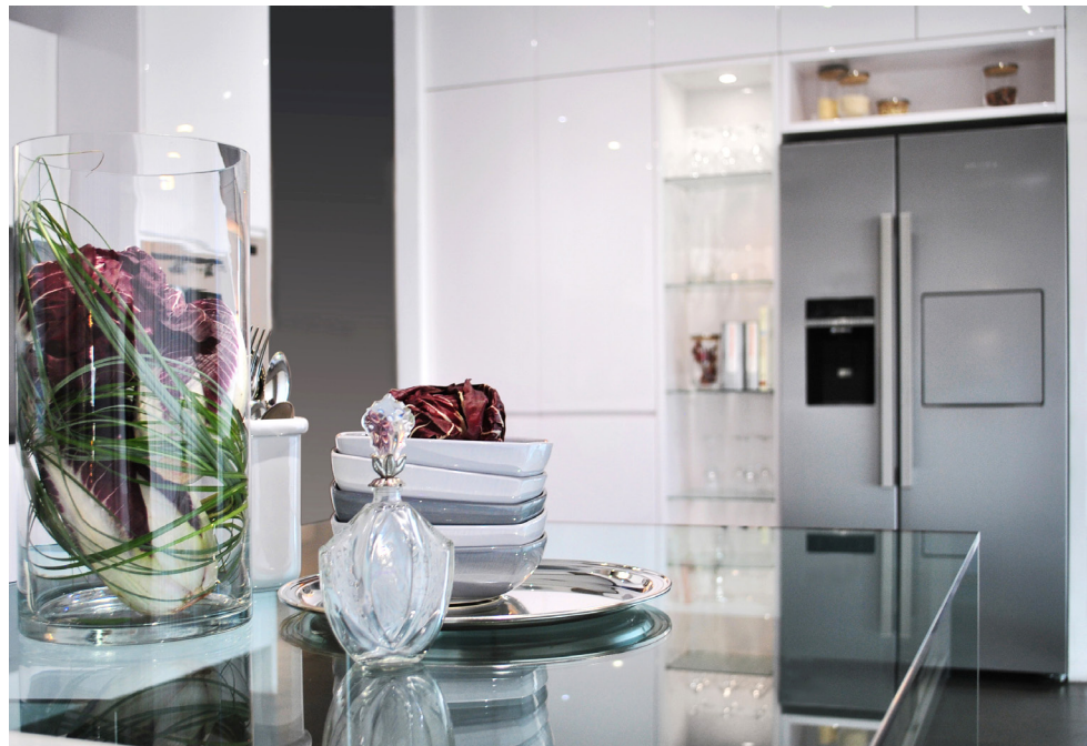
OPEN-SHELVED COLUMN WITH CRYSTAL SHELVES