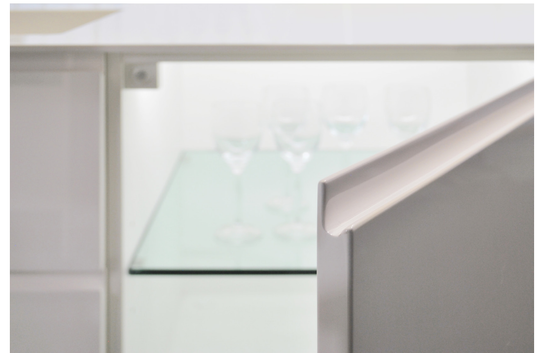
DETAIL: BUILT-IN DOOR HANDLE. BASE WITH CRYSTAL SHELVES AND INTERNAL LED LIGHTING