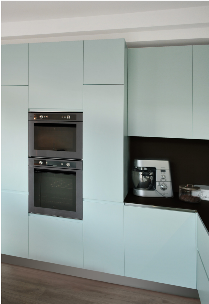
WALL EQUIPPED WITH OVEN COLUMN, FRIDGE, AND PANTRY. ANGULAR BASIS WITH RACK BASKETS