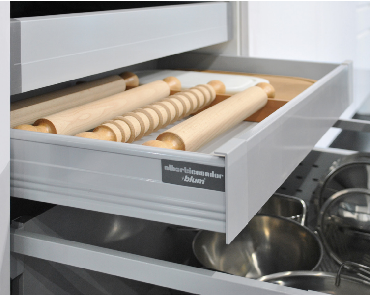
WOODEN ROLLER-PIN HOLDER