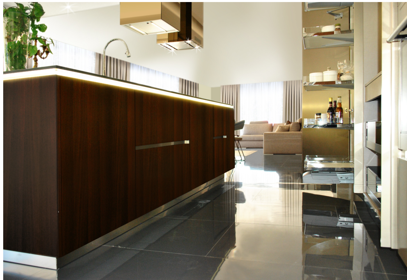
ISLAND WITH THERMOMECHANICALLY-PROCESSED DURMAST AND UNDERTOP LED LIGHTING