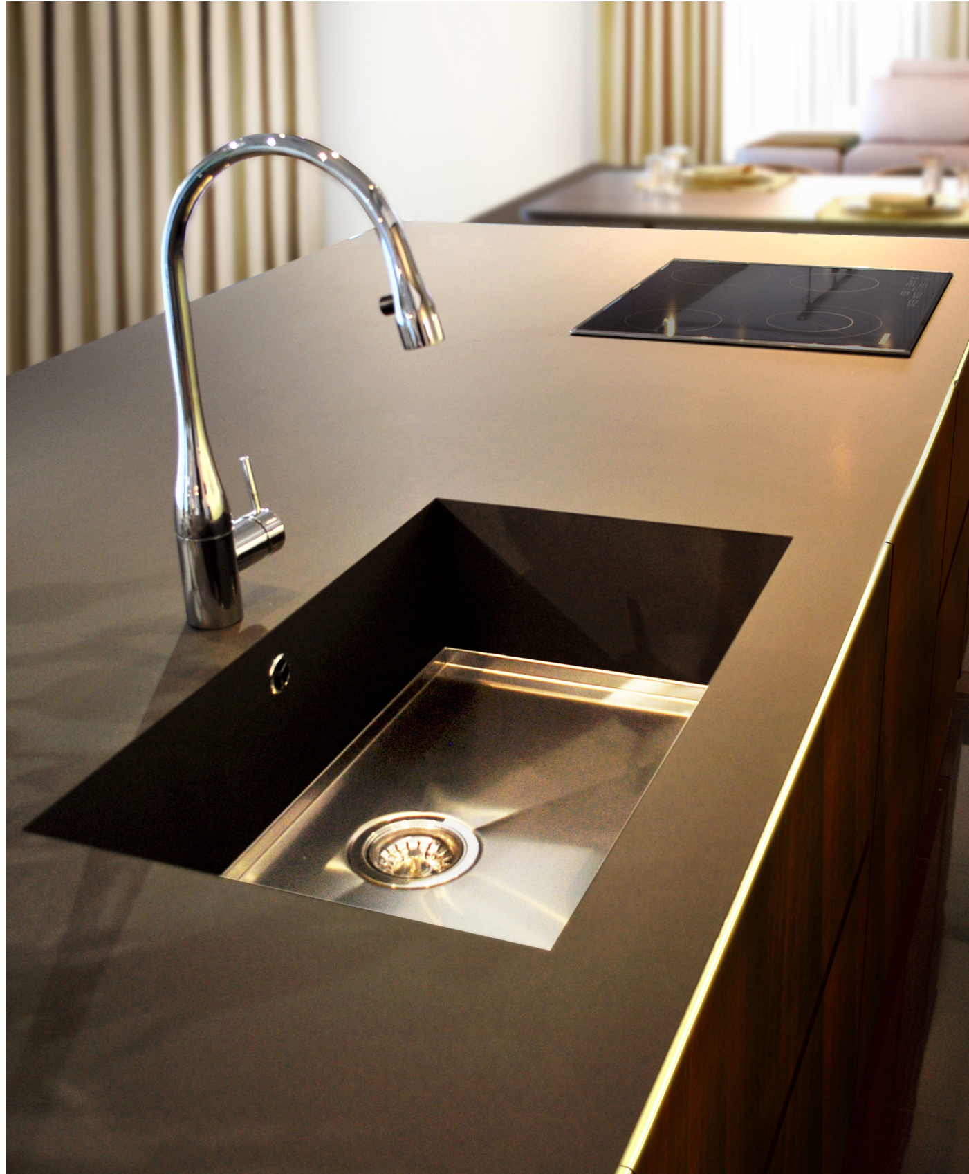
WORK ISLAND WITH INDUCTION COOKTOP AND SINK WITH FENIX BASINS AND STEEL BASIN FLOORS