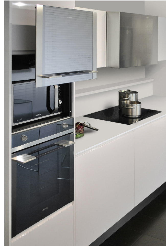
STOVE SHELF DOOR COORDINATED WITH THE ADDITION OF AN OVER-THE-RANGE MICROWAVE OVEN STAINLESS-STEEL HOOD AND INDUCTION STOVE