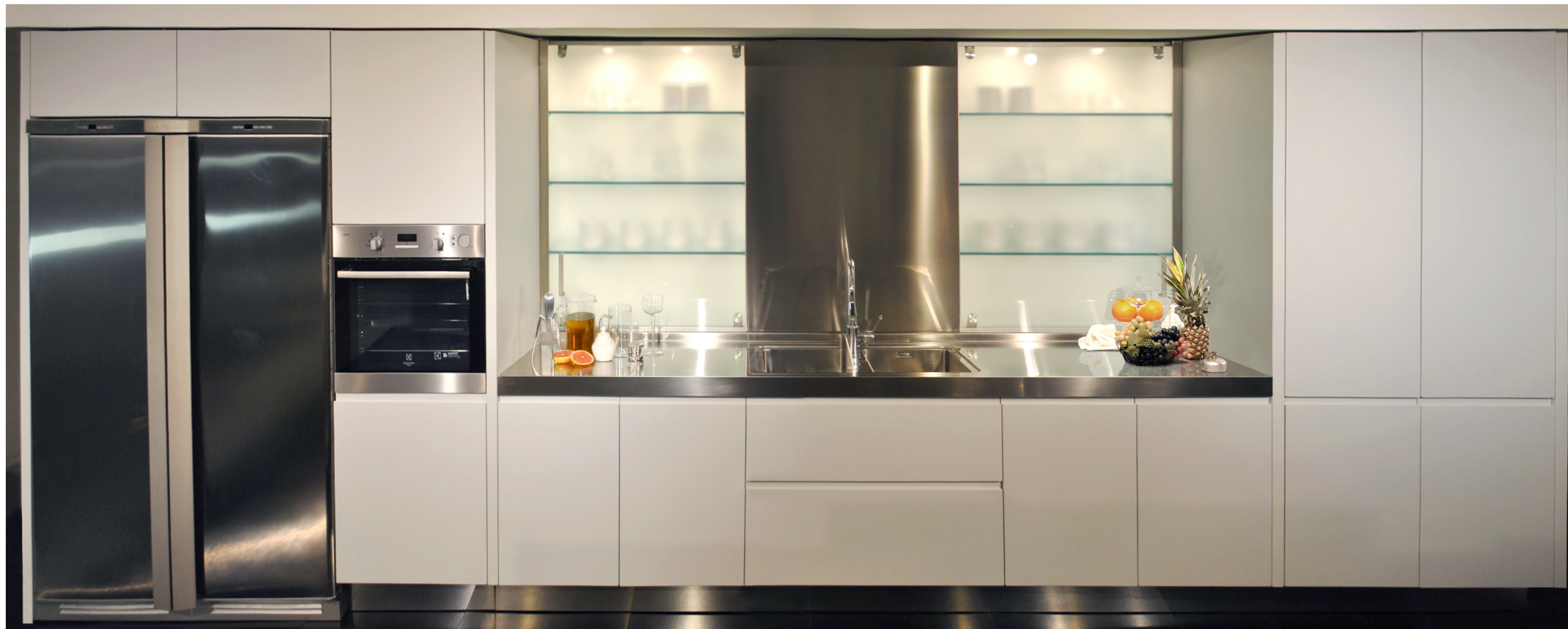
WALL EQUIPPED WITH BACKTOP DISPLAY CASES, SLIDING DOORS, CRYSTAL SHELVES AND LED LIGHTING