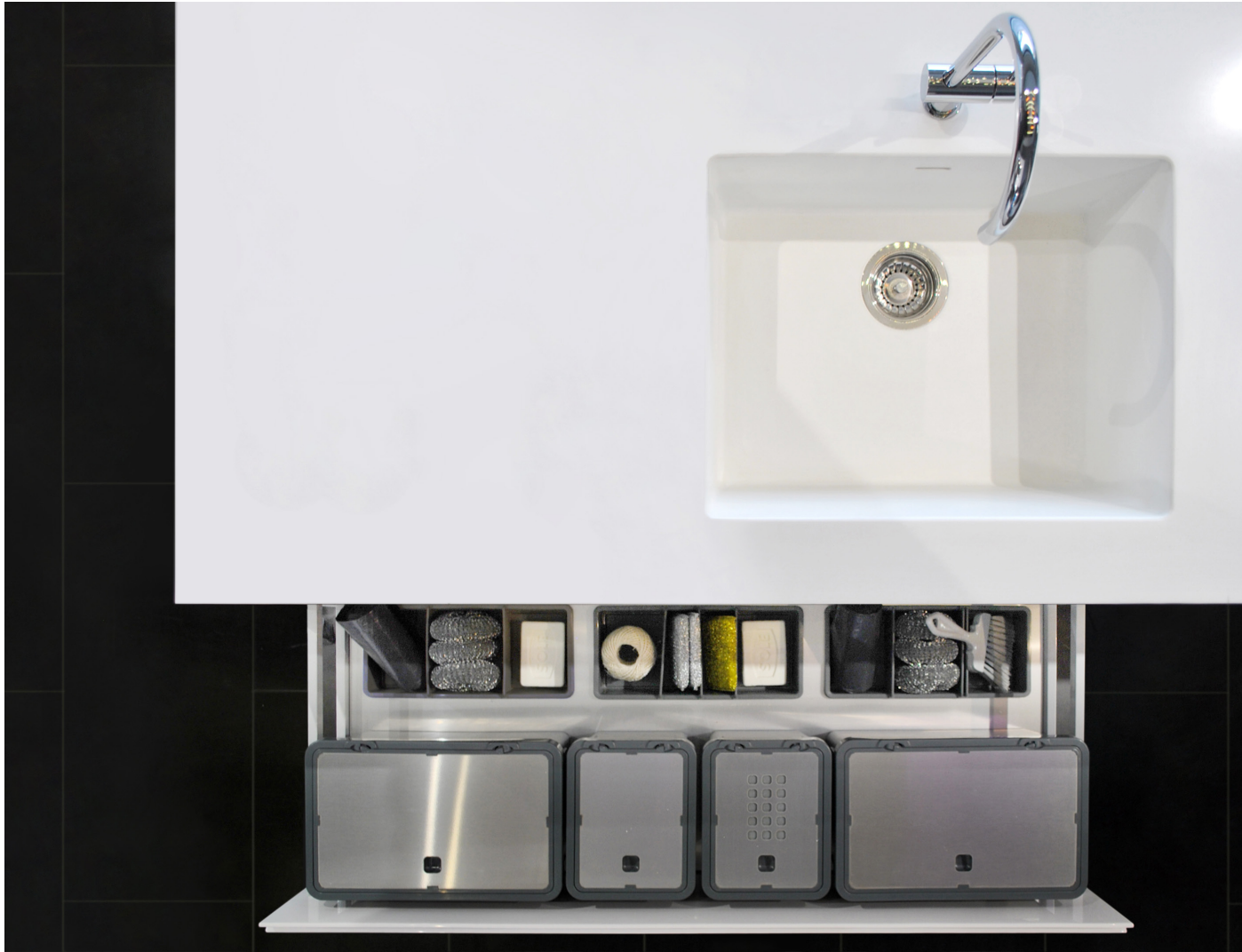
GARBAGE DISPOSAL WITH A RANGE OF VARIOUSLY SIZED CONTAINERS, SPONGE-HOLDER AND DETERGENT-HOLDER DIVIDERS