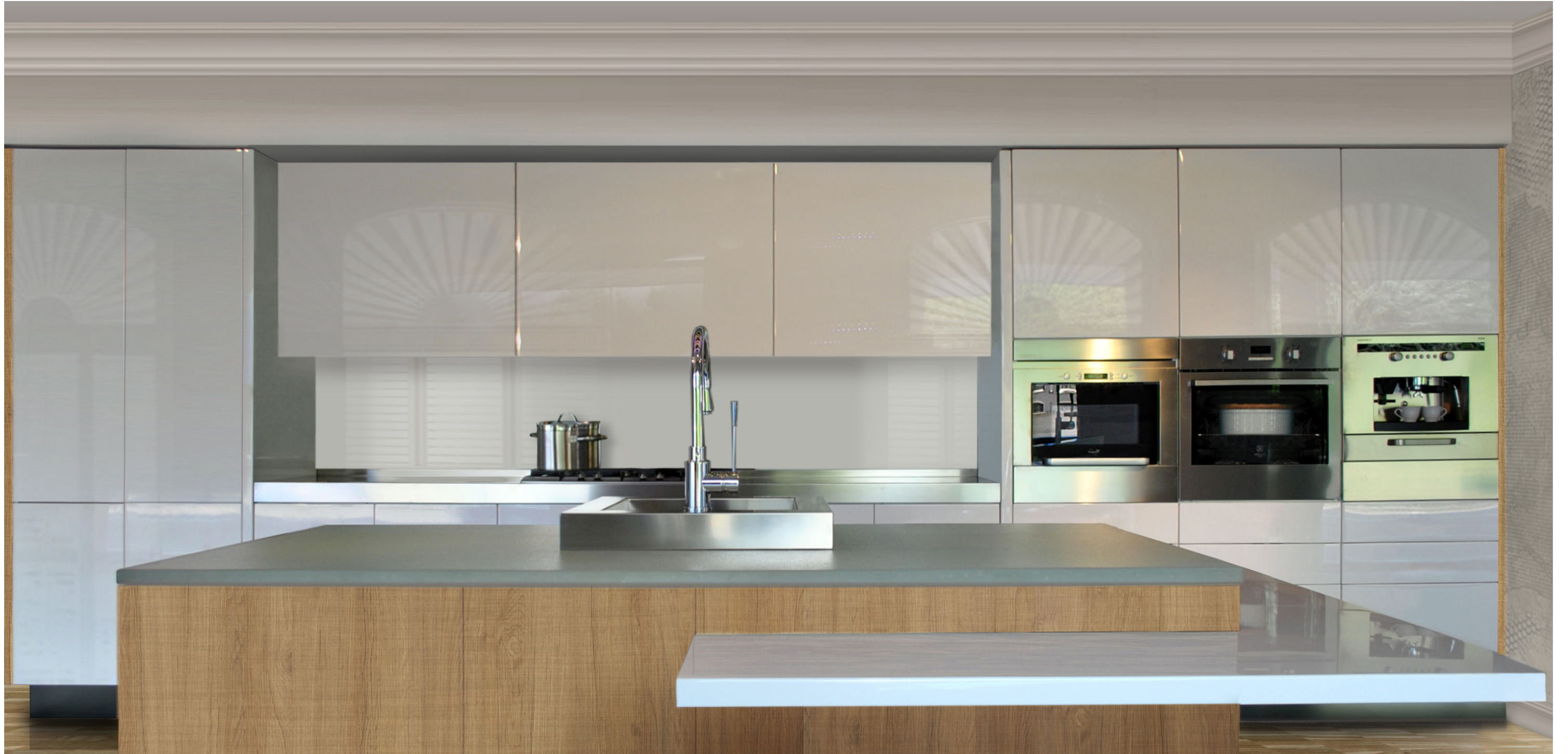
KITCHEN WITH POLISHED WHITE LACQUERED POLYESTER DOORS AND ISLAND WITH NATURAL DURMAST DOORS