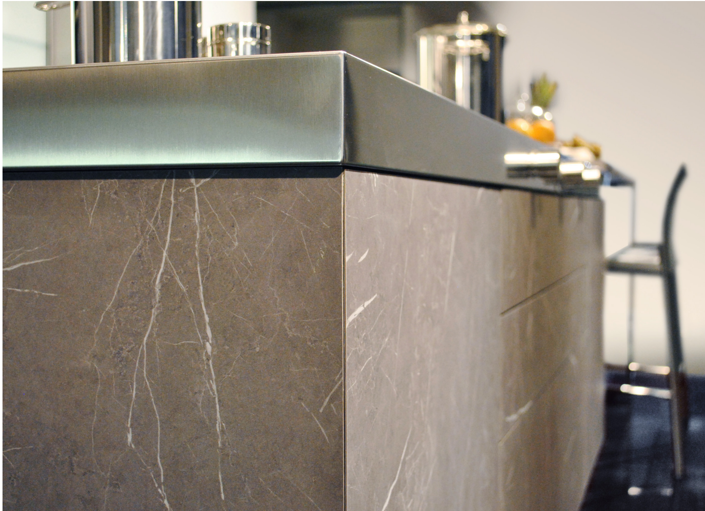
DOORS DETAIL: 45° PROCESSING IN THE BROWN GRAPHITE MATERIAL AND STAINLESS STEEL COUNTERTOP 7 CM THICK