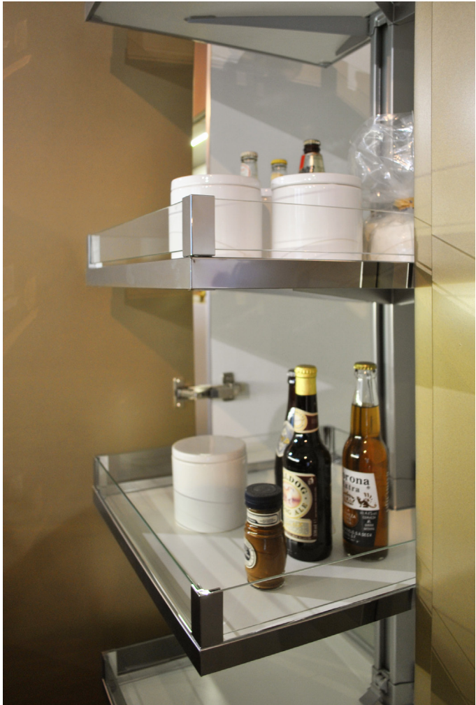
DETAIL: PANTRY COLUMN WITH PULL OPENING AND ADJUSTABLE SHELVING