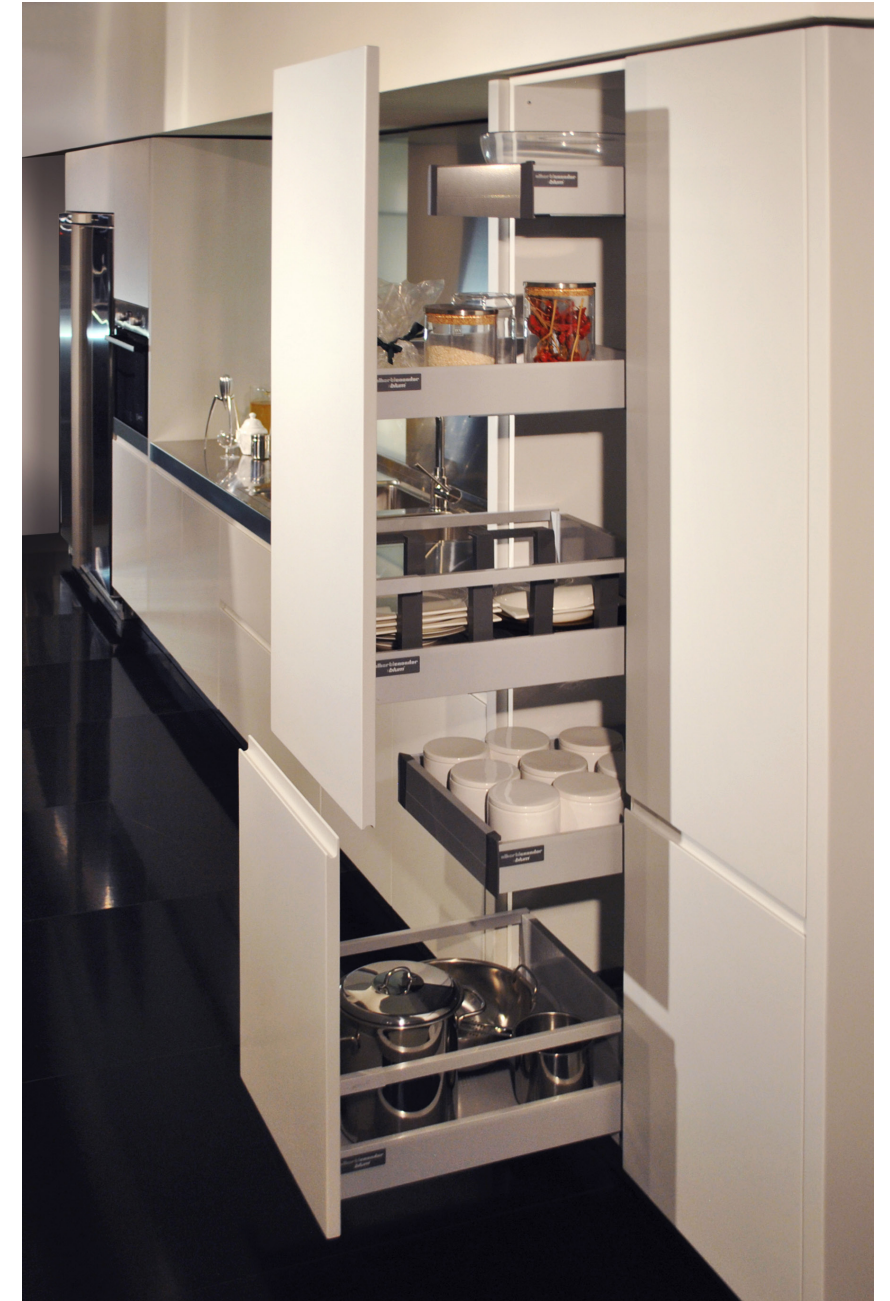
PULLOUT COLUMN WITH TWO DOORS AND INTERNAL DRAWERS