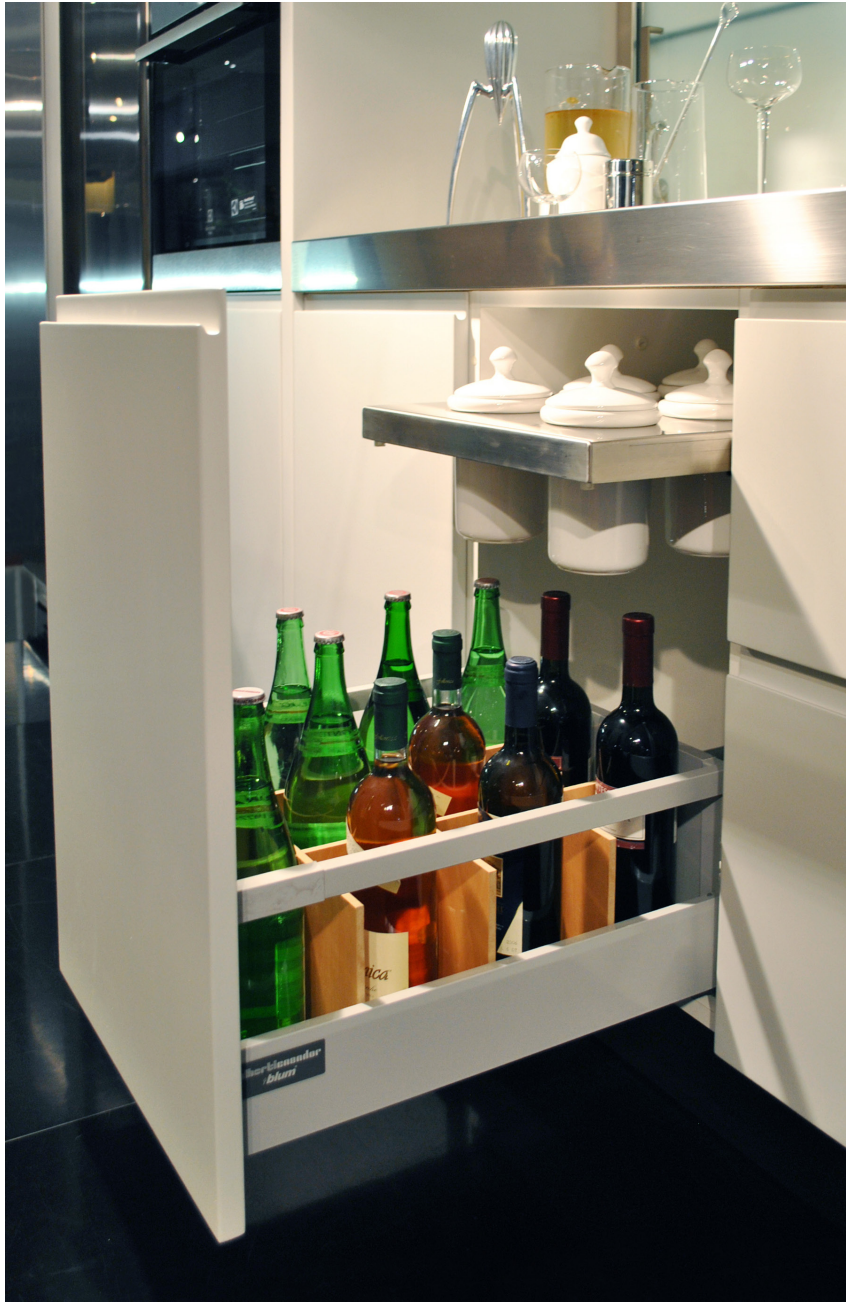
PULLOUT BOTTLE-HOLDER WITH WOODEN DIVIDERS AND PULLOUT JAR-HOLDER COUNTERTOP