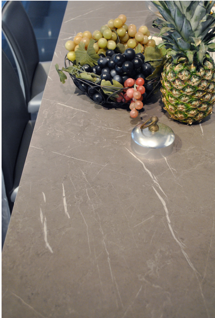
PARTIAL VIEW OF THE SNACK TABLE AND OF THE ISLAND WITH COOKING TOP AND GLASS BACKSPLASH